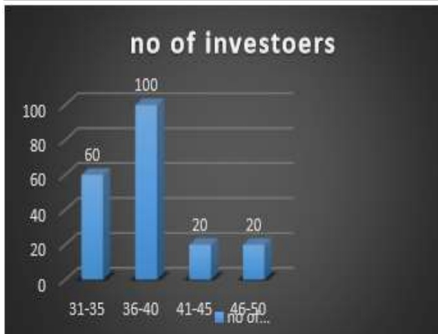
Chart No 1

The plan called for exactly fifty percent of Devgad's entire population of two hundred individuals to fall within the age range of thirty-six to forty years old. There were exactly two hundred people living in Devgad. In addition to the people who were between the ages of 31 and 30, who were a part of the second cohort, the third cohort was made of people who were between the ages of 31 and 40. Thirty percent of those who belonged to the second age group, more specifically those whose ages varied from 41 to 45 as well as those whose ages spanned from 46 to 50, participated in the survey.